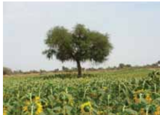
Drip irrigation introduced to farmers in Tharparkar

Further, in partnership with Agrow Lahore, MJSF is also in the process of initiating an income support and capacity building scheme by providing qingqi vehicles, technical selling expertise, training and avenues for trade to local farmers in the nearby districts of Lahore.