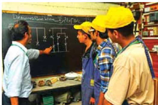
Students at the Karigar Training Institute

We think that for a nation to progress, investment in education is absolutely essential. MJSF educational initiatives encompass support for special education, higher education, vocational training, and development of schools in rural areas, particularly the two most populated provinces of Sindh and Punjab in Pakistan.