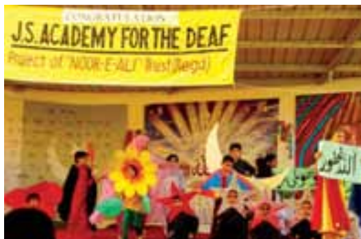
Annual day at the JS Academy for the Deaf

MJSF extends donations to prominent institutions like the Lahore University of Management Sciences (LUMS), Institute of Business Administration, Karachi (IBA) and the Karachi Education Initiative (KEI) for the Karachi School for Business and Leadership (KSBL).