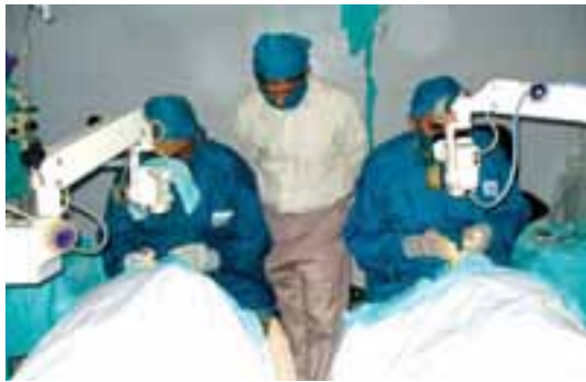
Cataract operations being conducted at the MJSF eye camp

MJSF is linked with numerous projects and organizations in health care including; Sindh Institute of Urology and Transplantation (SIUT), Karachi National Hospital, The National Institute of Cardiovascular Diseases (Emergency Ward) and other notable social enterprises.