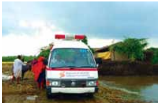
Medical relief being provided to the flood affectees

Displaced Persons Crisis and the floods in recent years, with close collaboration with almost all United Nations' clusters operating in Pakistan, along with organizations such as IOM, Oxfam, WFP and the Provincial Disaster Management Authority.