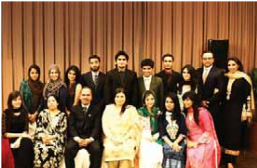
NUS Students with the Pakistani Consul General in Singapore

It also partners with unique organizations for children with disabilities such as the JS Academy for the Deaf. The Academy has applied with the concerned authorities for the graduation program and is currently in the process of researching, developing and patenting Islamic Sign Language.